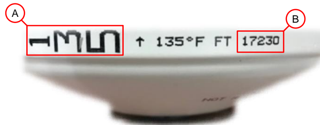
Figure 4: Affected product identification

Step 3 (if applicable): Take photo of residential attic or residential garage installation