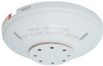
Figure 1: 281B-PL Series mechanical heat detector