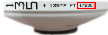
Figure 2: Location of manufacturing date code on detector.